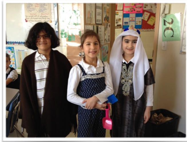
Grade 3 student actors