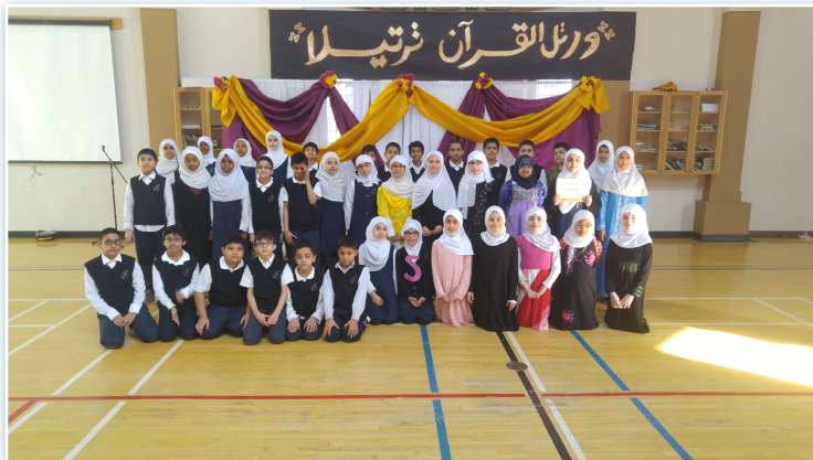
Grade 5 Compassion Assembly

Congratulations to all of the winners! Next year's Quran Competition will have a lot to live up to.